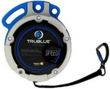
Model TBSD150-20 (16m and 12.5m)