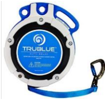
Model TB150-12C (12.5m and 7.5m)